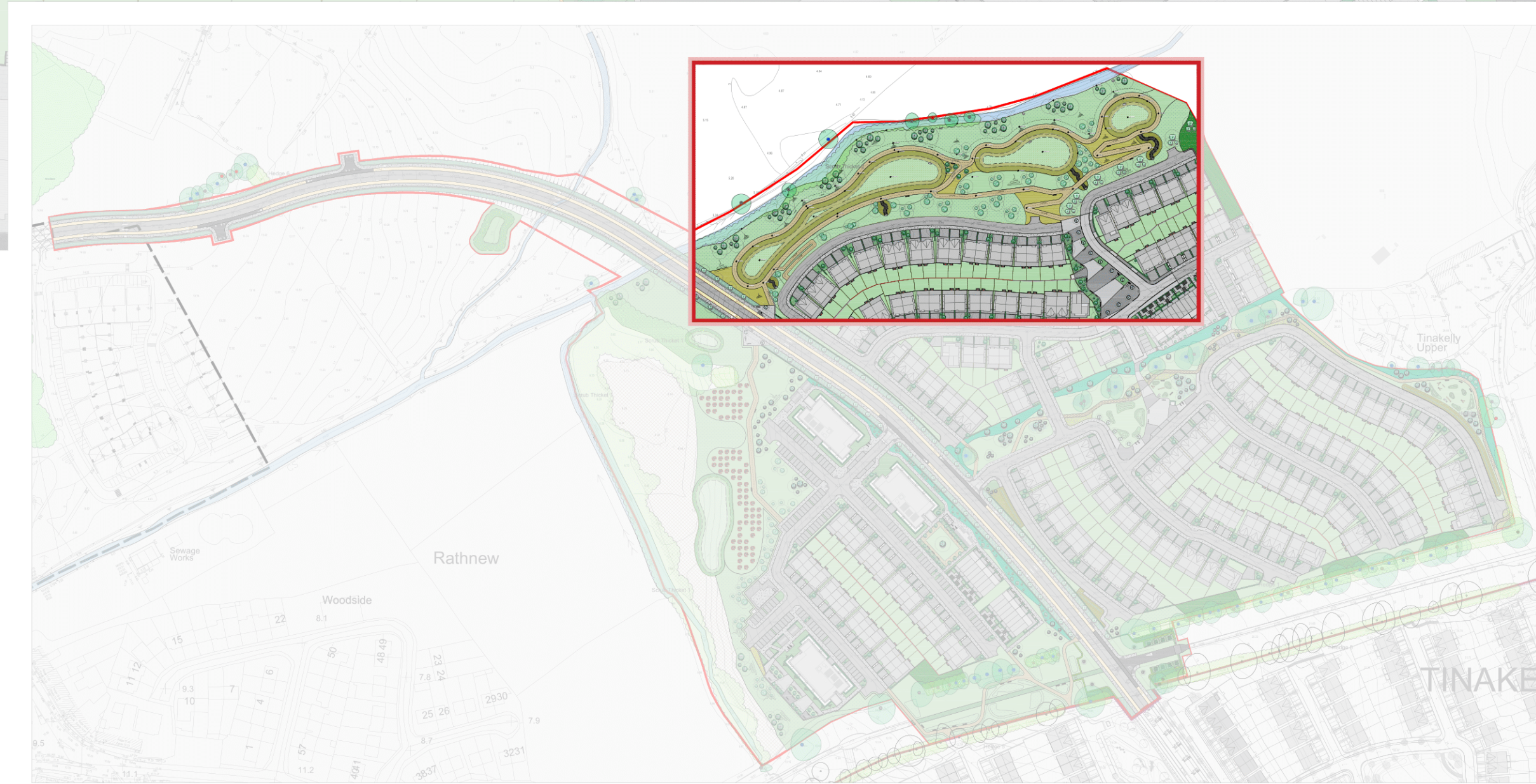
INDICATION PLAN SCALE: 1:3000 @ A1

DO NOT SCALE FROM THIS DRAWING. WORK ONLY FROM FIGURED DIMENSIONS ALL ERRORS AND OMISSIONS ARE TO BE REPORTED TO LANDSCAPE ARCHITECT